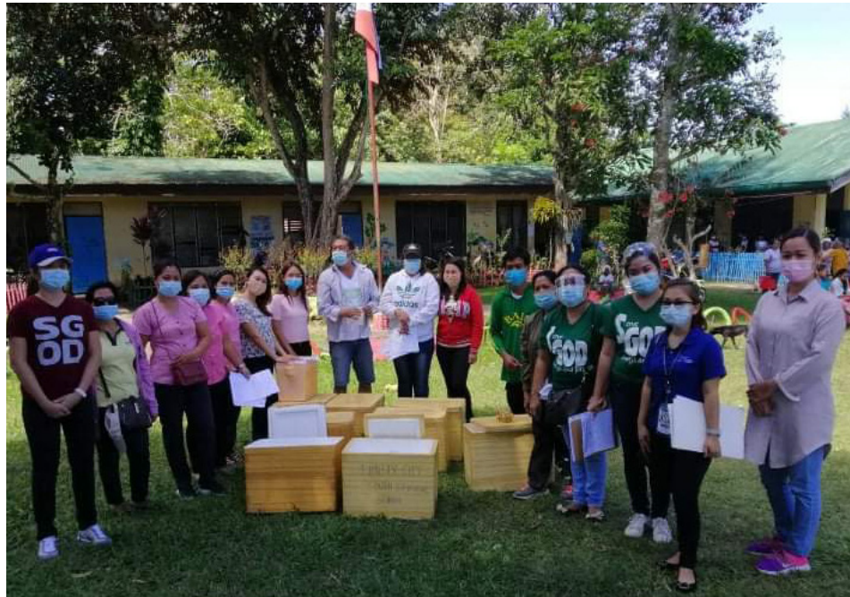
Suppliers for the program deliver milk products to the designated drop-off points.

A total of 19,895 children in the cities of La Carlota, Bago, Bacolod, Bais, and Tanjay benefited from the milk feeding program last year led by the Department of Education (DepEd) in Negros Island in tie-up with the DA-PCC at La Carlota Stock Farm (DA-PCC at LCSF).