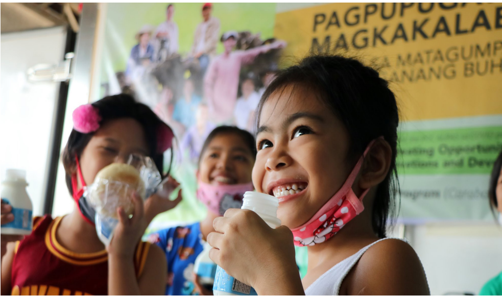
Approximately 26% of the total number of beneficiaries were able to receive milk from the initial implementation of the milk feeding program.

The initial implementation of the milk feeding program, led by the Department of Education (DepEd) through the help of 30 assisted cooperatives of DA-Philippine Carabao Center (DA-PCC), had supplied the milk requirements of 503,955 undernourished children in 2019, which is equivalent to 26.12% of the total number of beneficiaries nationwide.