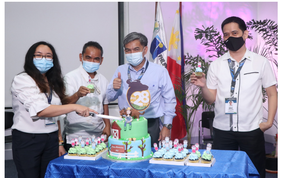
DA-PCC officials cap off the virtual celebration with a cake-cutting ceremony.

strategic partnerships with the local government, academic community, and the private sector.